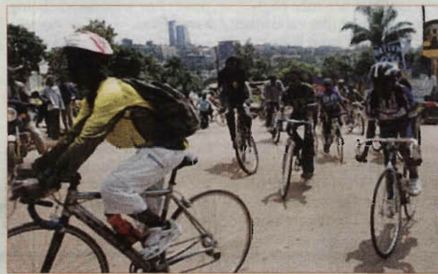
"Let Kampala Car Free Day be a showcase for just how our city might look like, feel like, and sound like without cars...365 days a year".